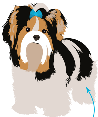
BIEWER TERRIER The AKC recognized four new breeds in 2021.