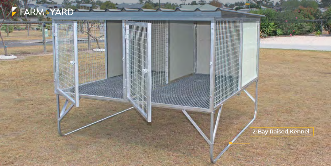
2-Bay Raised Kennel