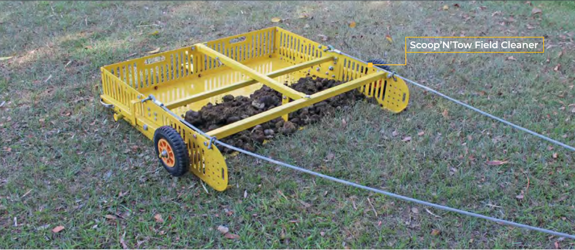
Scoop'N'Tow Field Cleaner