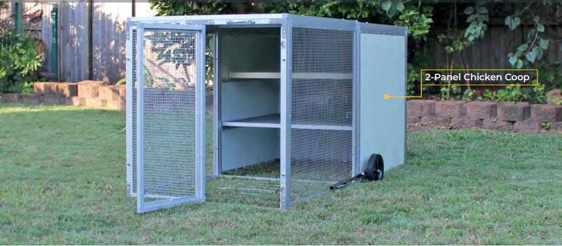
2-Panel Chicken Coop