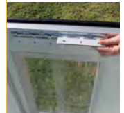
Removable door flaps