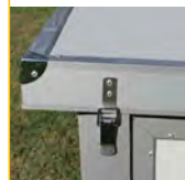
Removable latched roof