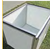
Thick insulated walls