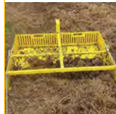
Smooth & rough paddocks