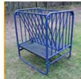
Low & high height settings