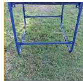
Braced for stability