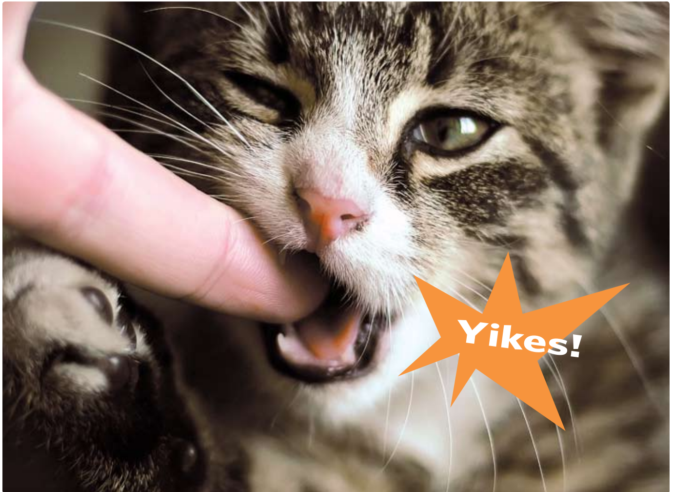
Adopters of biting kitties should be informed of their pets' nibbling issues and educated on safe ways to interact with their feisty furballs.

Over the years, cats have overtaken dogs as America's favorite companion animal. More than 60 million cats are now kept and enjoyed by millions of Americans. Low-maintenance and independent—compared to their needy canine counterparts—their self-sufficient personalities have made them ideal animal companions for people living in our frenetic times.