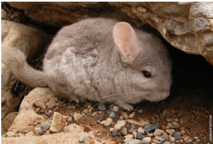
Native to cold mountain regions in South America, chinchillas have long been exploited for their fur.

Between 11:30 p.m. the first day and 6 a.m. the next, the chinchillas pushed the cans out of the way and chewed everything