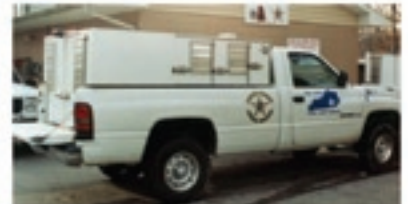
Slide In Units