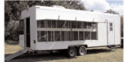
Trailers and Boxes